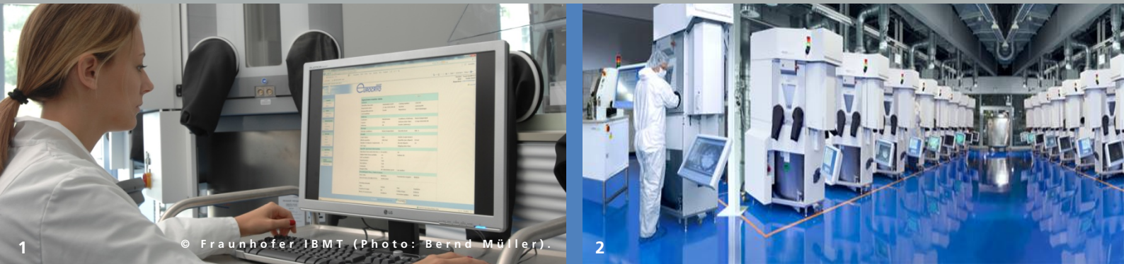
1 User interface EurocryoDB.